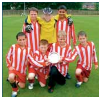
Clarendon Boys' mini soccer team