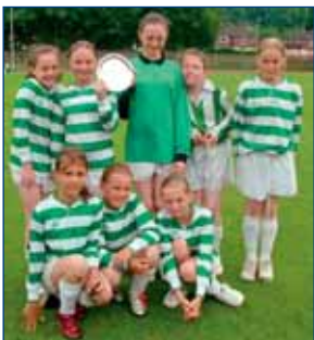
< Zouch Girls' mini soccer team