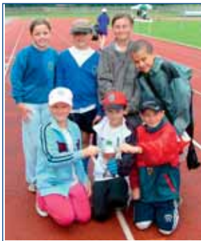
< Clarendon mini hockey team

The third Tidworth Primary Schools Sports Festival involved 450 children from 13 local primary schools, taking part in various sports at the Tidworth Leisure Centre and the Tidworth Oval. Local Tidworth schools were among the winners. Congratulations!