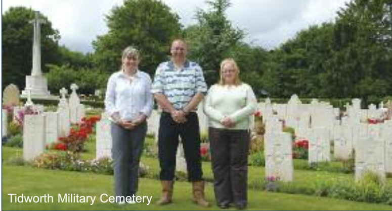
Tidworth Military Cemetery

Opened in 1904, just as Tidworth Camp was first being built, Tidworth Military Cemetery holds nearly 2000 graves of soldiers and some of their families too, dating from 1905 to the most recent, only a few months ago.