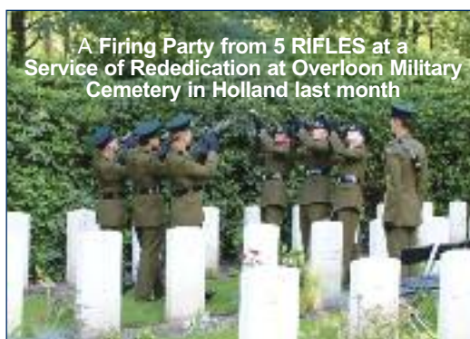
A Firing Party from 5 RIFLES at a Service of Rededication at Overloon Military Cemetery in Holland last month

British Military Cemeteries the world over are places of peace and tranquility, fitting resting places for soldiers who have died in the service of their country.